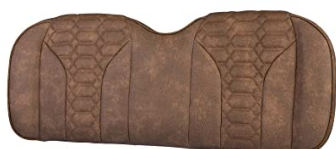
MODZ® FS2 Custom Golf Cart Front Seat for Club Car Precedent/Onward/Tempo...

Golf carts come in various styles, from the basic models to the luxurious ones that resemble high-end cars. Luxury carts often come with advanced features, plush seats, state-of-the-art sound systems, and custom paint jobs. On the other hand, standard carts are more about functionality, ensuring you get from point A to B efficiently. Your choice will depend on your budget, needs, and, of course, your personal style.