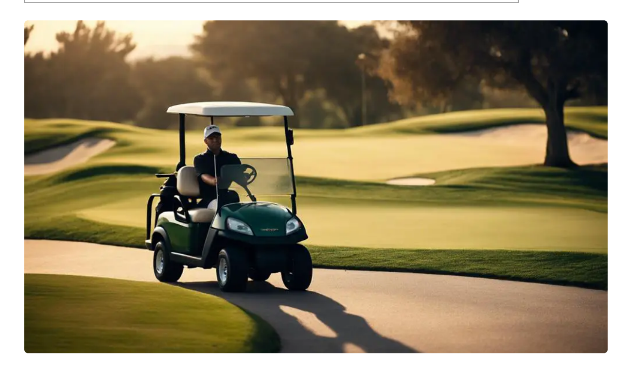
Table of Contents >

Last Updated on March 4, 2024 by Chuck Wilson